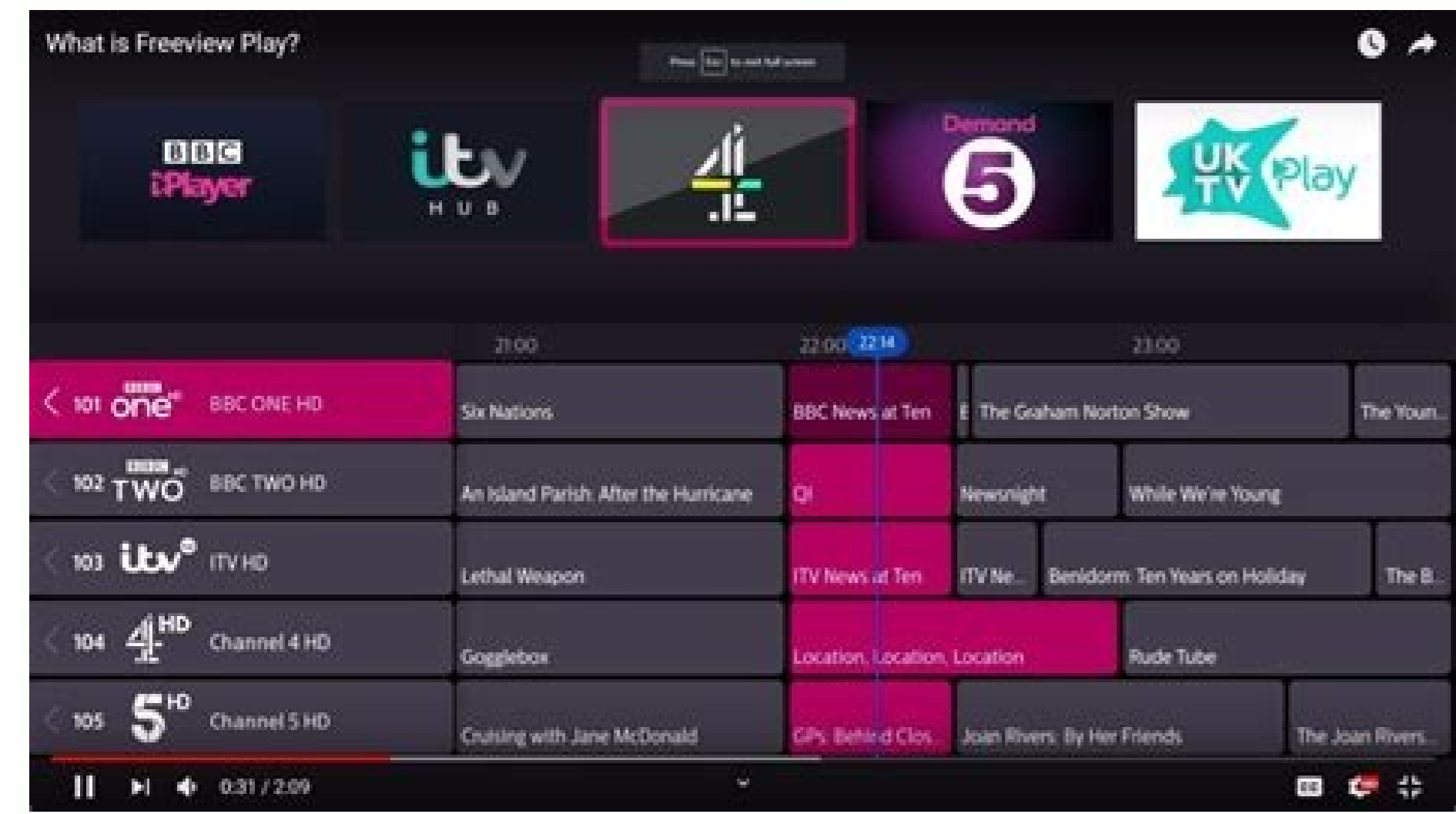
ITV4 tv guide tomorrow. ITV4 plus 1 tv guide. ITV4 tv guide saturday. ITV4 tv guide racing. ITV4 uk tv guide. ITV4 live tv guide. ITV4+1 tv guide. ITV4 tv guide now.